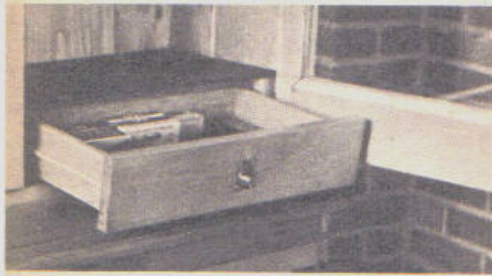
Hidden when doors are closed, drawer holds ammunition, clips.