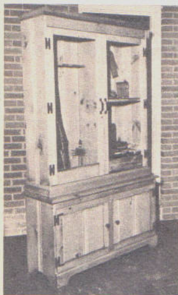
Easy to build and easy to look at, this knotty pine cabinet will show off your best guns, keeping them safe, clean.